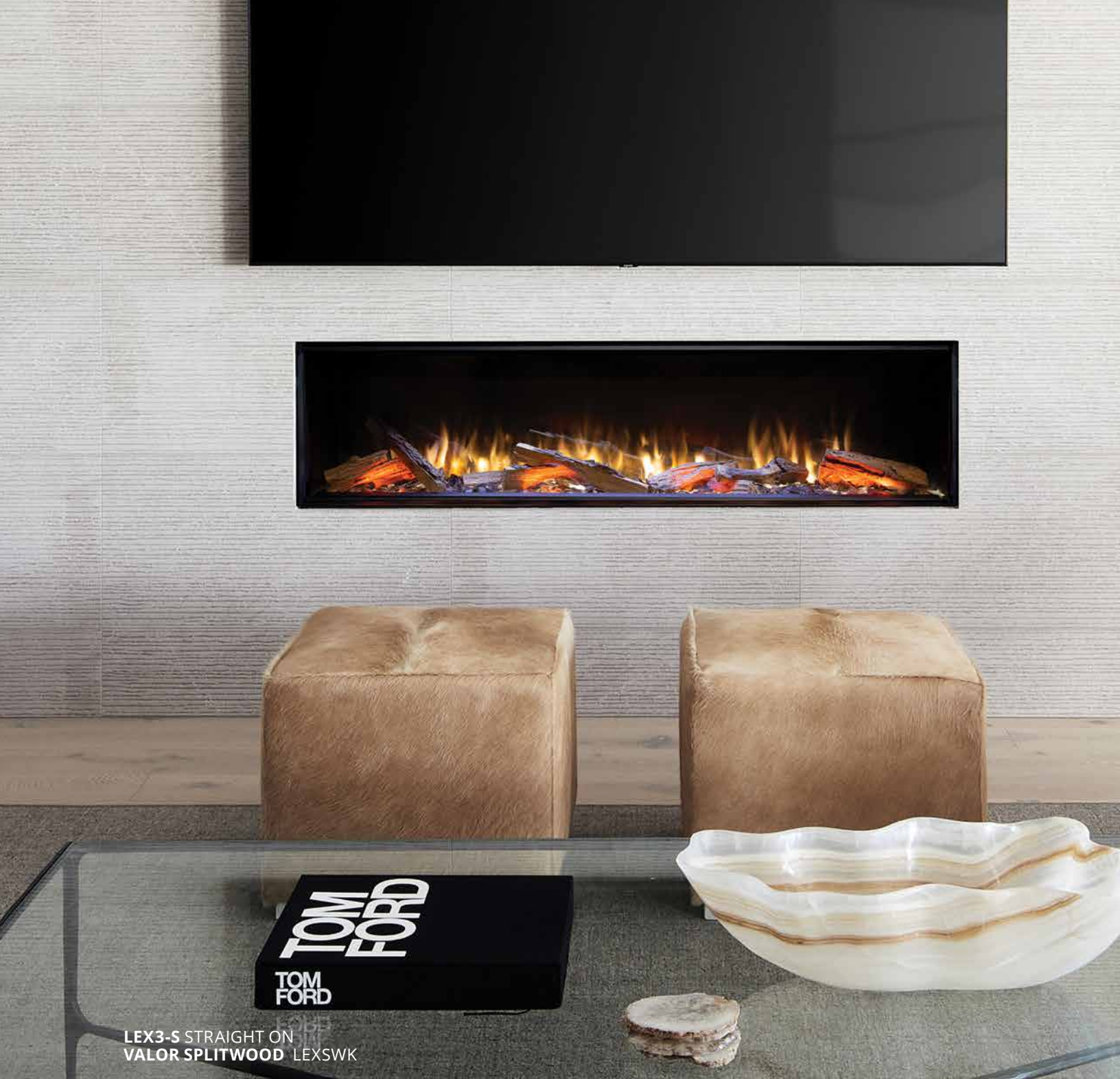
LEX3-S STRAIGHT ON VALOR SPLITWOOD LEXSWK