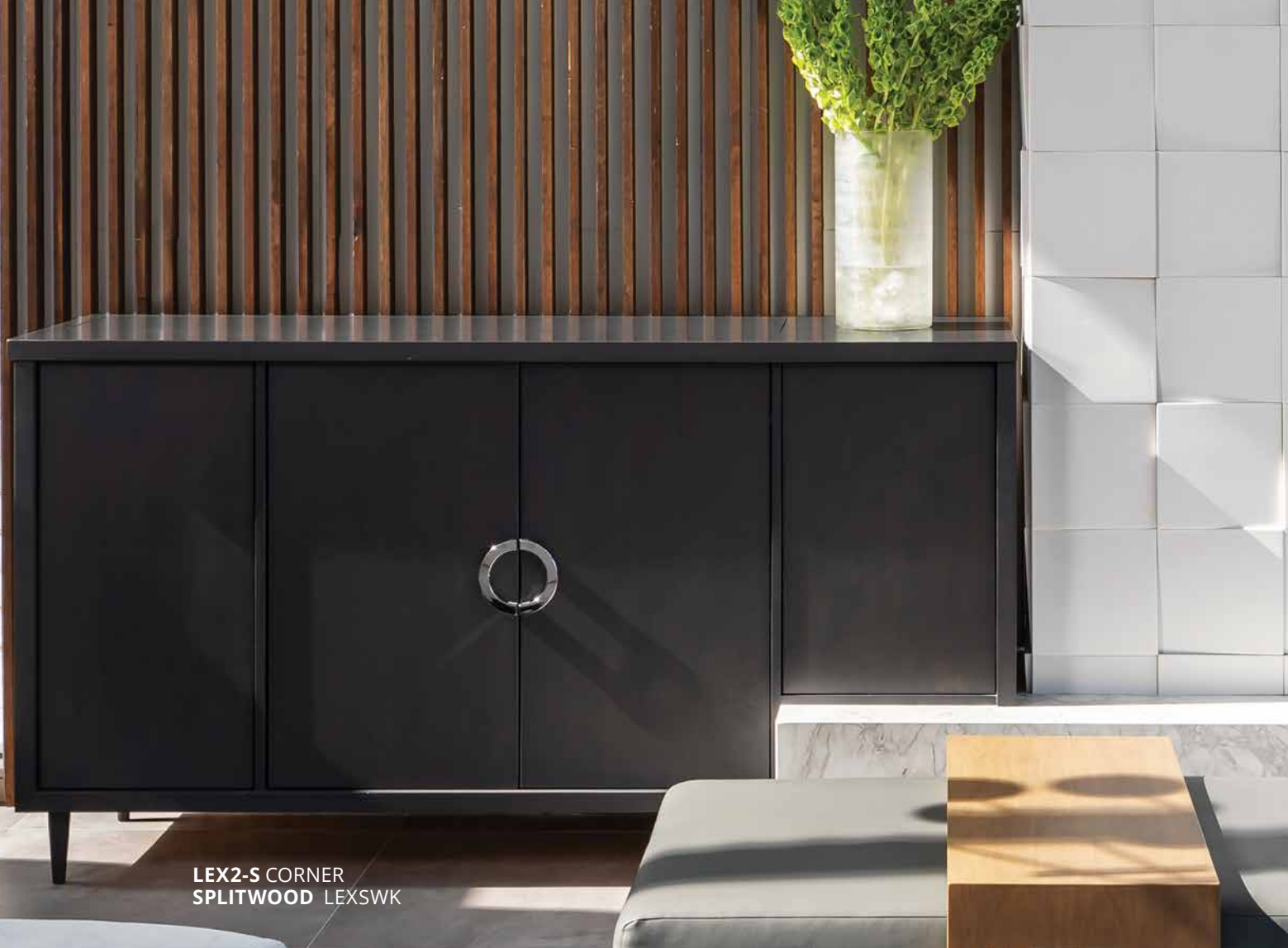
LEX2-S CORNER SPLITWOOD LEXSWK