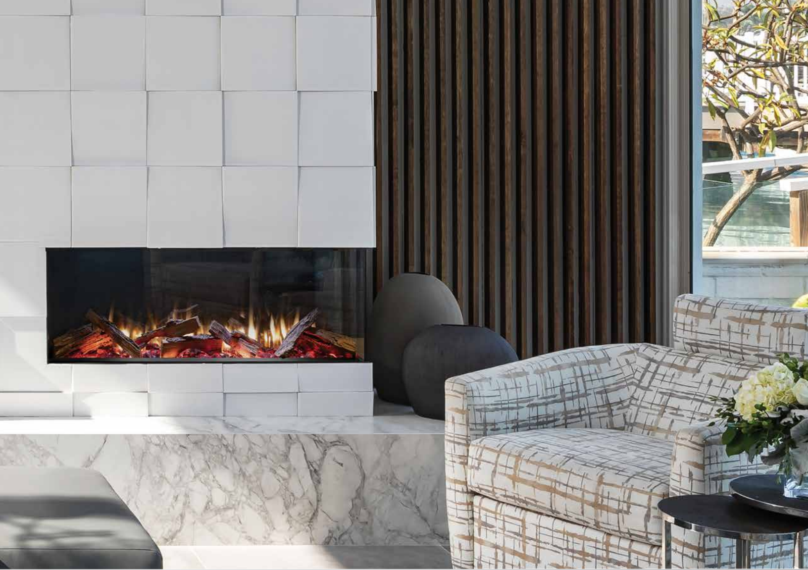
LEX3-S 59" WINDOW