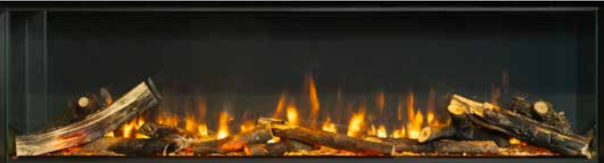
LEX 3, 60"