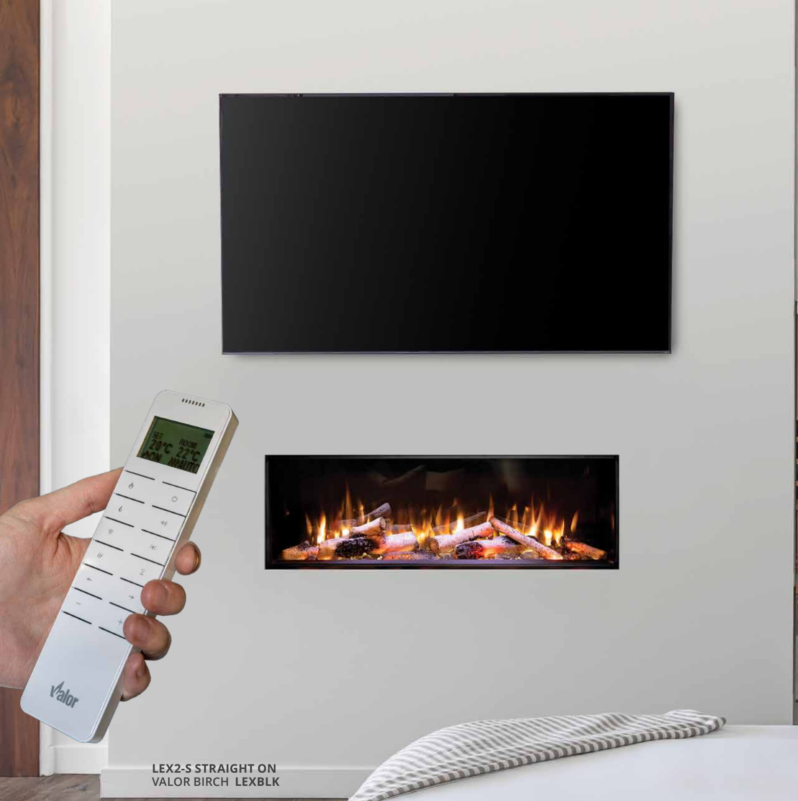
LEX2-S STRAIGHT ON VALOR BIRCH LEXBLK