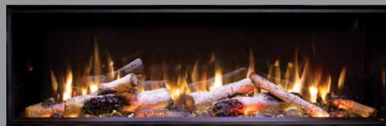
LEX2-S 49" WINDOW

Scan the QR code to find out about a model.