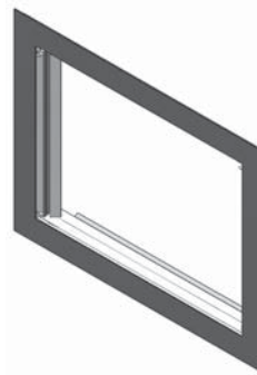
1140FSB 4-sided trim