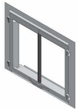
1149EDV Edgemont Double-Door Kit