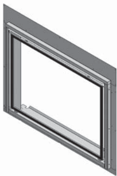
1130FFK Fixed Framing Kit