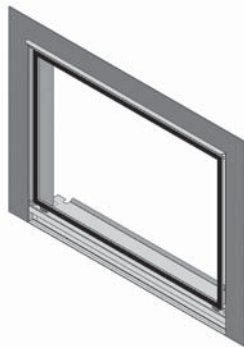
1135TSB 3-sided trim